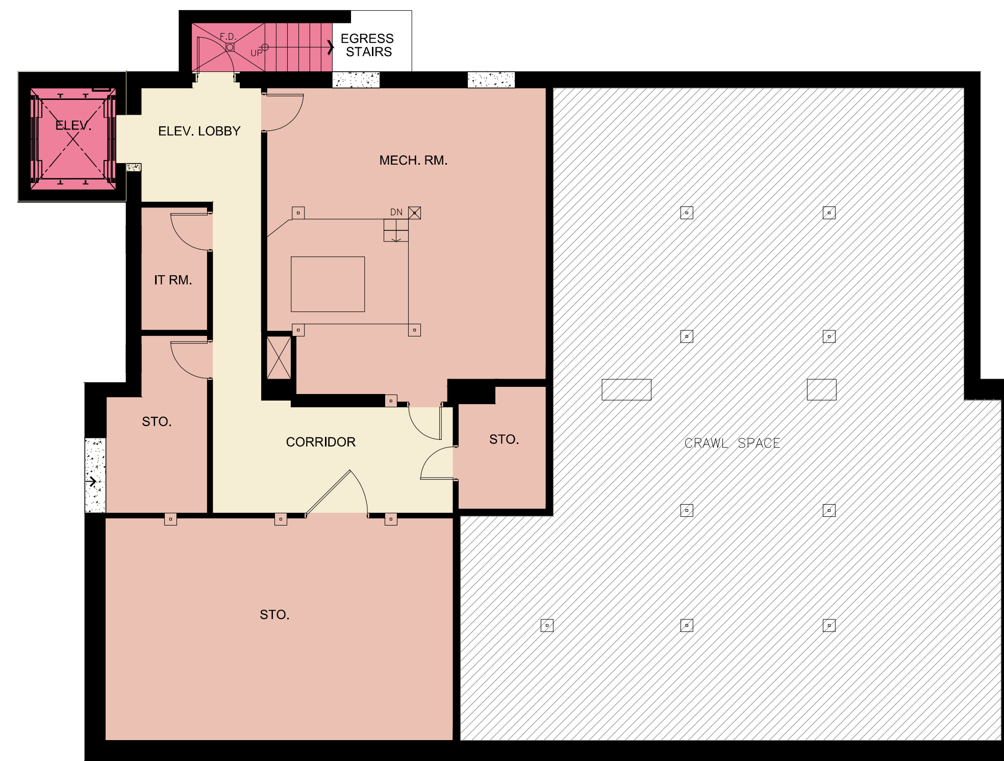
NEW BASEMENT PLAN